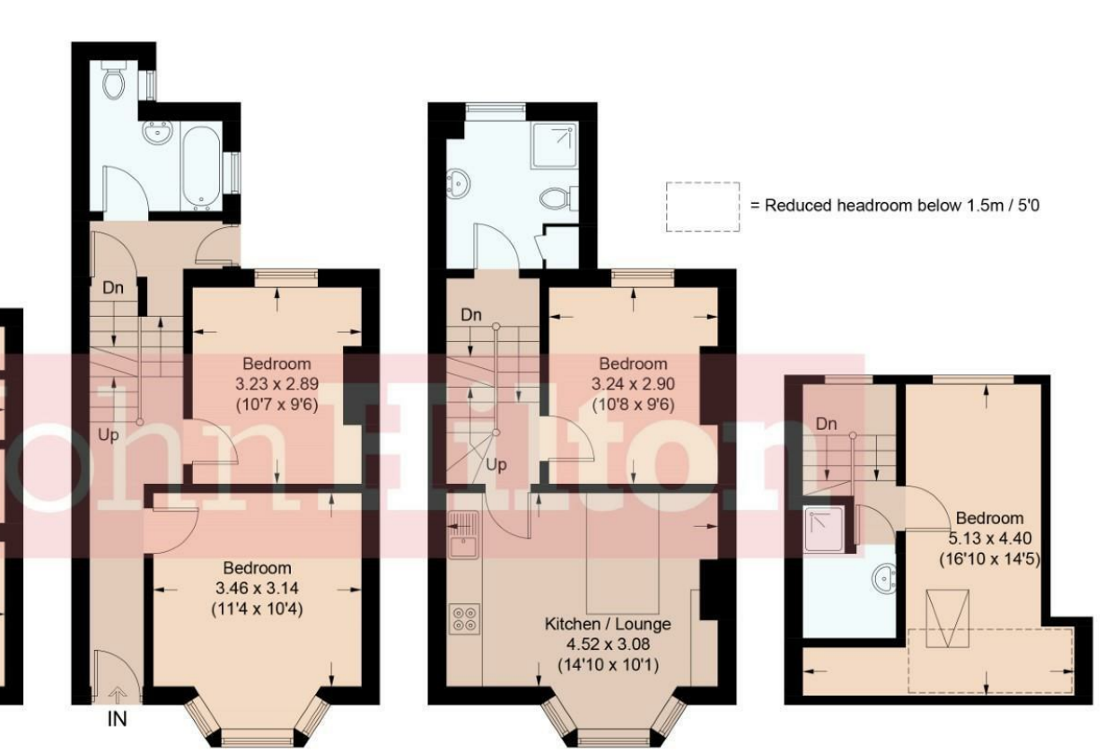
Illustration for identification purposes only, measurements are approximate, not to scale. Imageplansurveys @ 2024