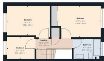
2nd Floor Building 1