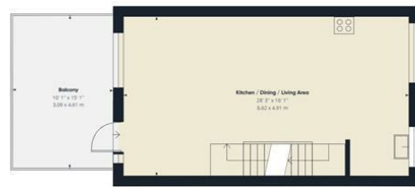
1st Floor Building 1