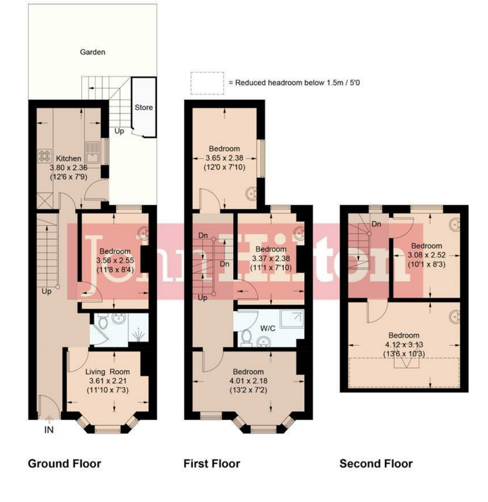
Illustration for identification purposes only, measurements are approximate, not to scale. Imageplansurveys @ 2024

Approximate Gross Internal Area = 105.7 sq m / 1138 sq ft