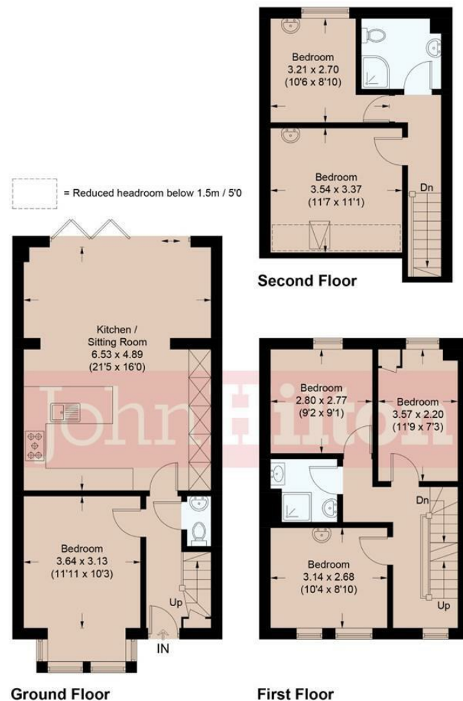
Illustration for identification purposes only, measurements are approximate, not to scale. Imageplansurveys @ 2024