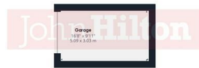
Floor -1 Building 1