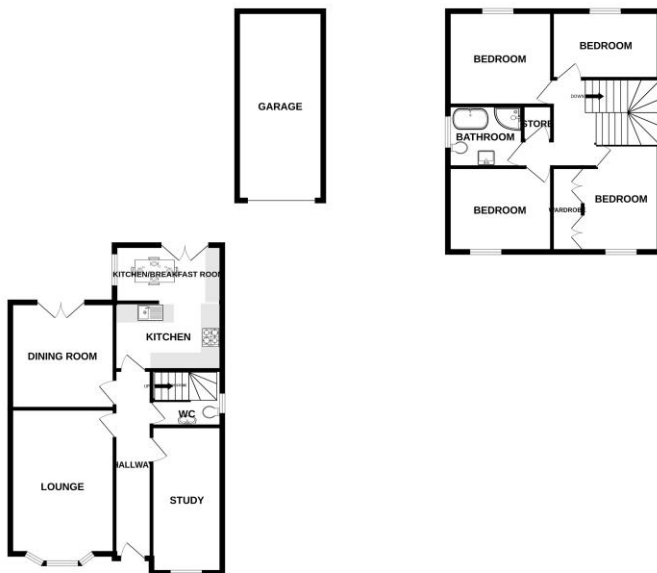
TOTAL FLOOR AREA: 1429 sq ft. (132.8 sq m.) approx.

While every effort has been made to ensure the accuracy of the floor plan, the dimensions, measurements, of areas, volumes, counts and any other data are approximate and no responsibility is taken for any errors, omissions or misstatements. This plan is for illustrative purposes only and should be used as a guide for the prospective purchaser. The surfaces, systems and appliances shown have not been tested and no guarantee will be given as to their condition or performance. Please refer to the contract documents for further details.