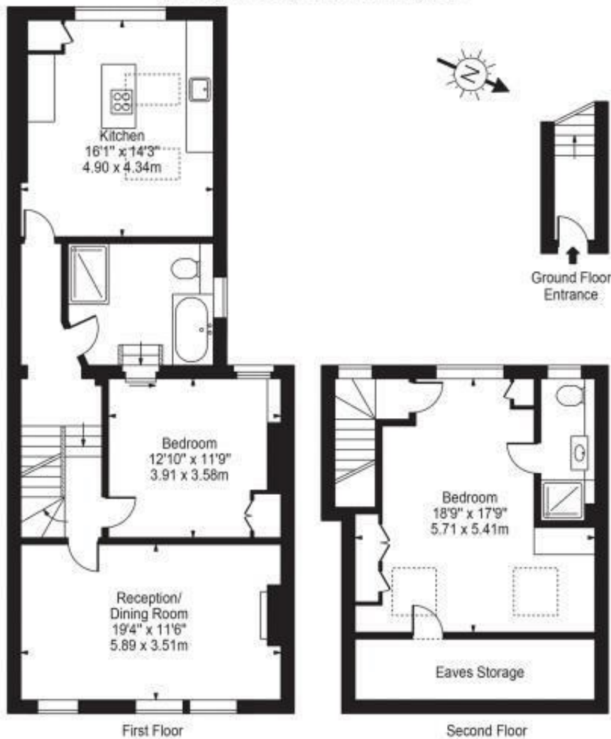
For Illustration Purposes Only - Not To Scale Floor Plan by Mira Nikolova Photography

Approx. Total Internal Area 1293 Sq Ft - 120.12 Sq M (Including Eaves Storage & Restricted Height Area) Approx. Gross Internal Area 1204 Sq Ft - 111.86 Sq M (Excluding Eaves Storage & Restricted Height Area)