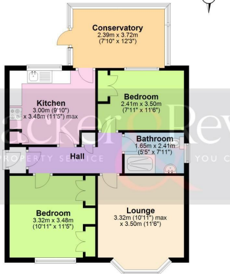
Total area: approx. 63.3 sq. metres (681.1 sq. feet)

Bournemouth Energy Floor Plans are provided for illustration/identification purposes only. Not drawn to scale, unless stated and accept no responsibility for any error, omission or mis-statement. Dimensions shown are to the nearest 7.5 cm / 3 inches. Total approx area shown on the plan may include any external terraces, balconies and other external areas. To find out more about Bournemouth Energy please visit www.bournemouthenergy.co.uk (Tel: 01202 556006) Plan produced using PlanUp.