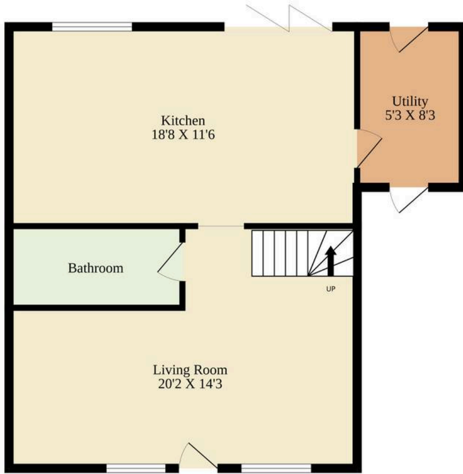
Ground Floor 711 sq.ft. (66.0 sq.m.) approx.