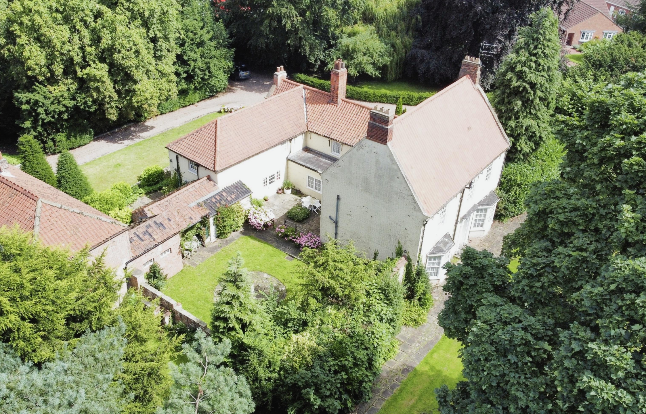
Melton Grange, Gibson Lane South, Melton, North Ferriby, East Yorkshire, HU14 3FP