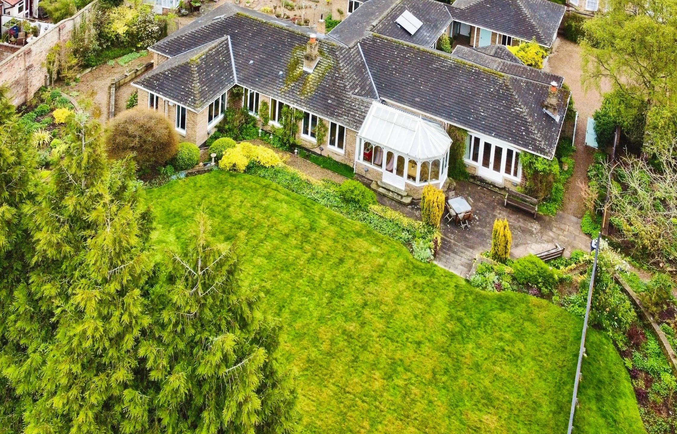
White Lodge, St. Giles Croft, Beverley, East Riding of Yorkshire, HU17 8LA