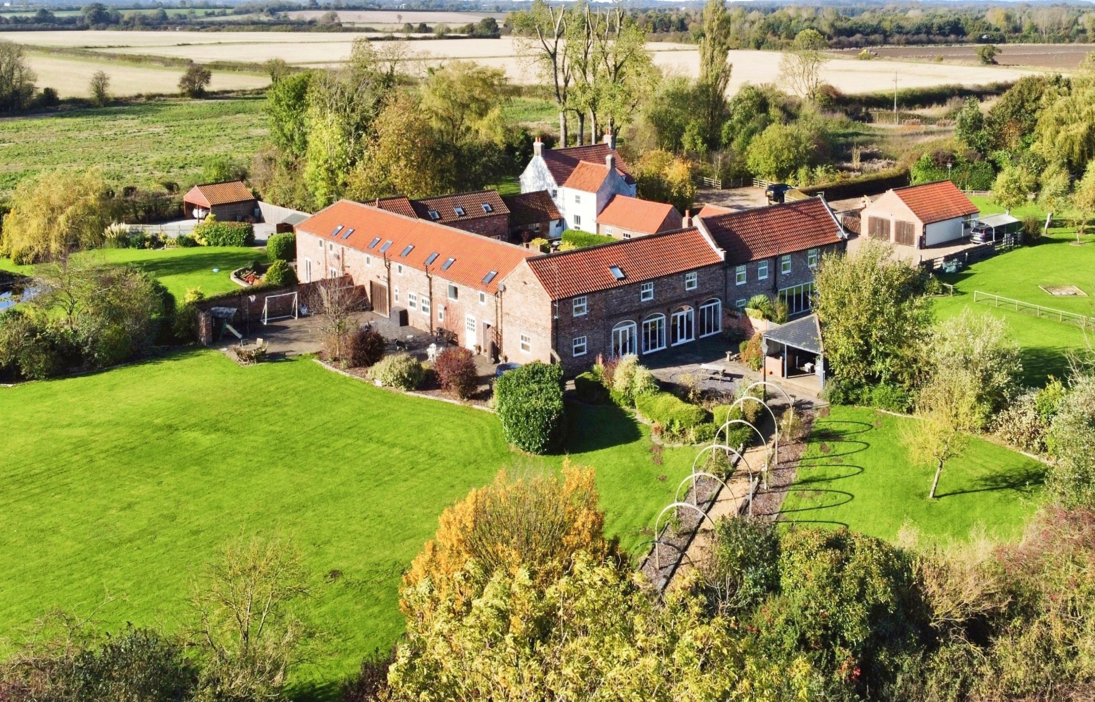
The Old Coach House, Carr Road, Beverley, HU17 7JZ