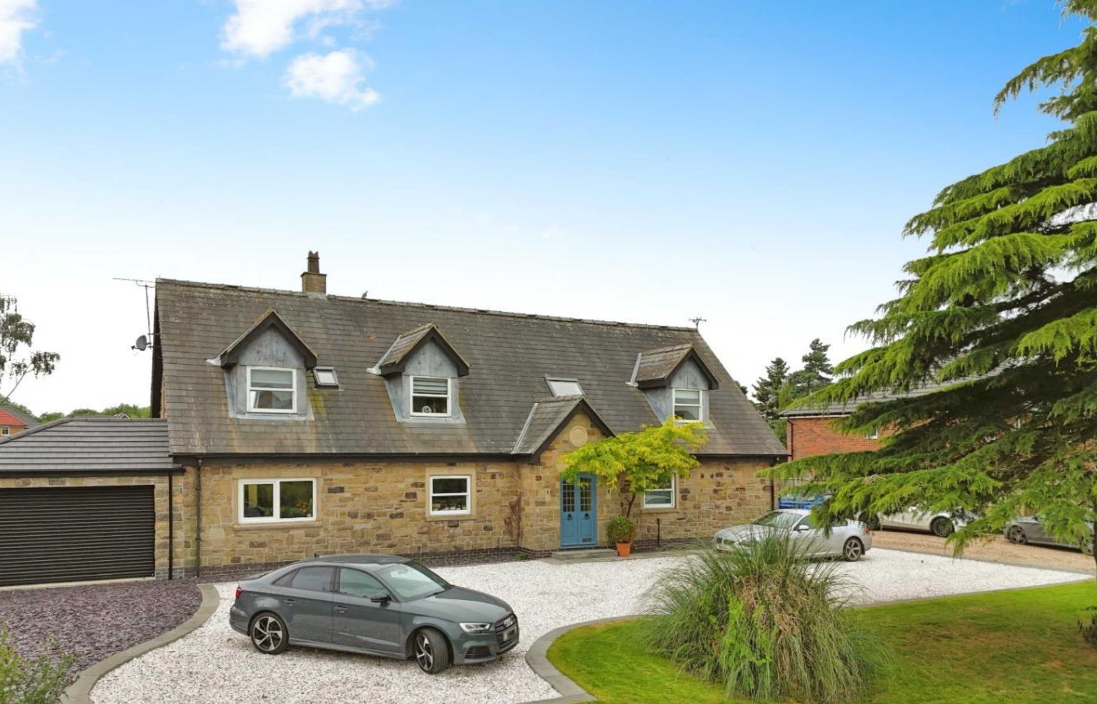
Springdale Stud, Long Lane, Beverley, East Riding of Yorkshire, HU17 0RN