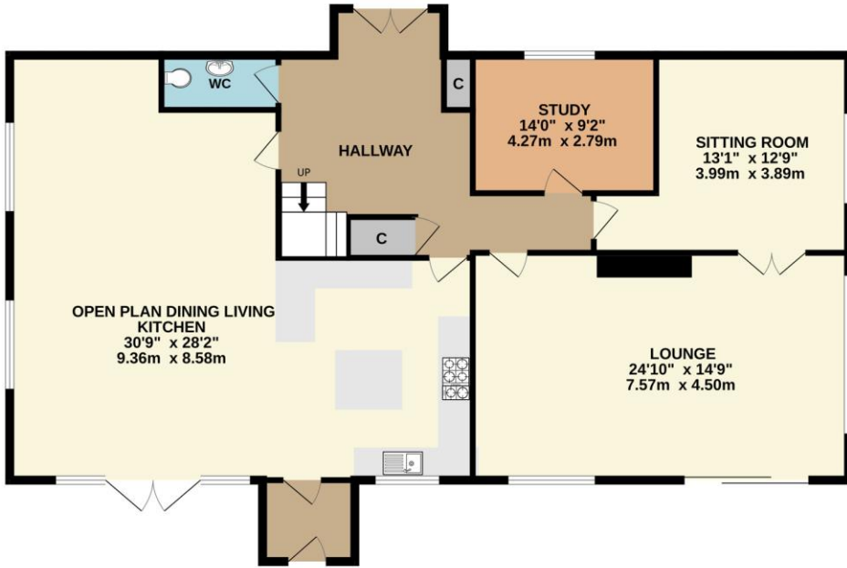
GROUND FLOOR 1613 sq.ft. (149.9 sq.m.) approx.