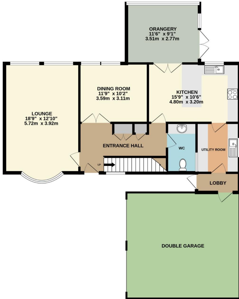
GROUND FLOOR 919 sq.ft. (85.4 sq.m.) approx.