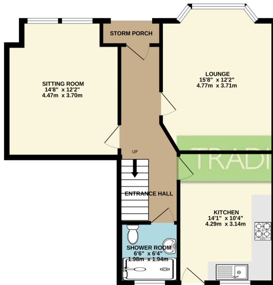
GROUND FLOOR 654 sq.ft. (60.8 sq.m.) approx.