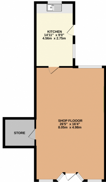
GROUND FLOOR 607 sq.ft. (56.4 sq.m.) approx.