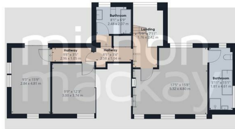
Floor 1 Building 1