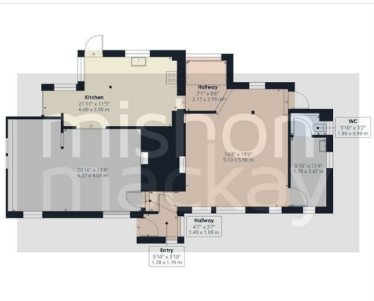
Floor 0 Building 1