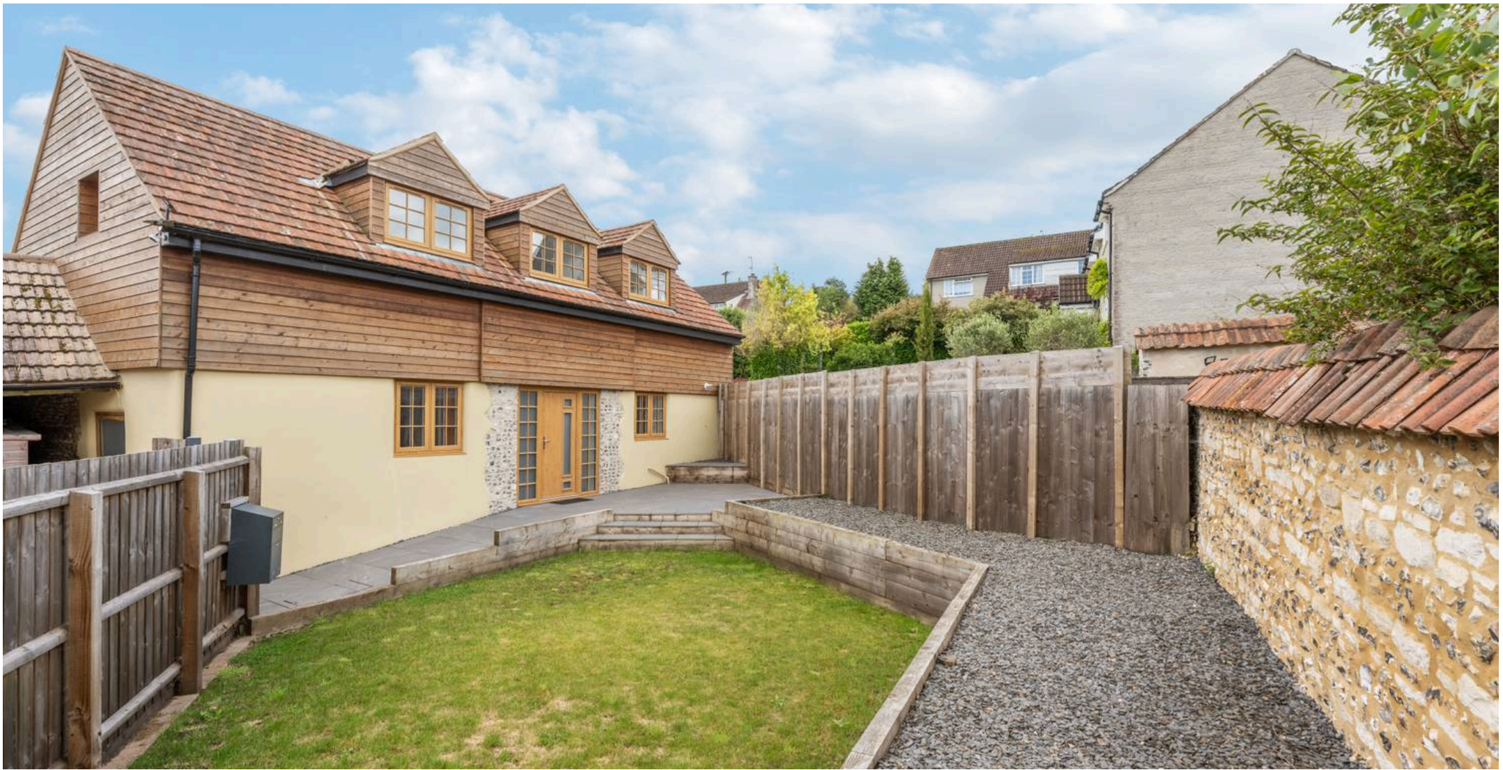
Hare Cottage, Winterbourne Abbas Dorchester