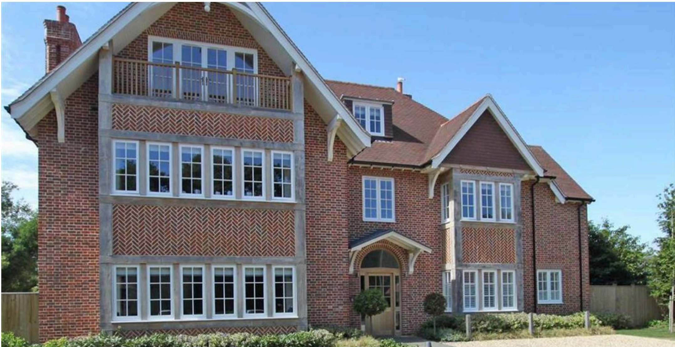
Flat 6, Chewton Oaks, 48 Ringwood Road Christchurch