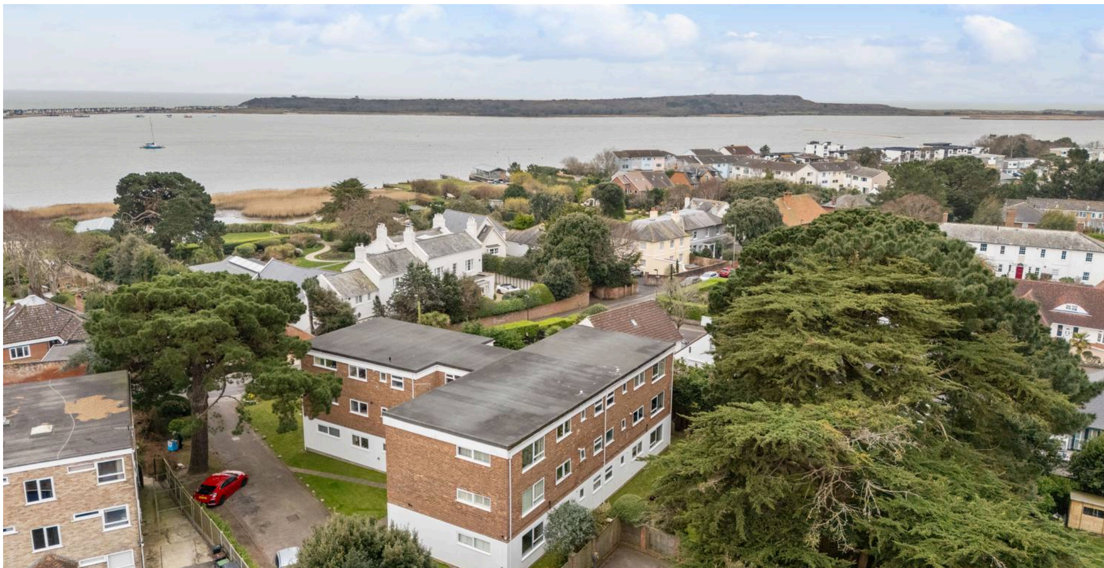
Flat 2, Mudehaven Court, 64 Mudeford Christchurch