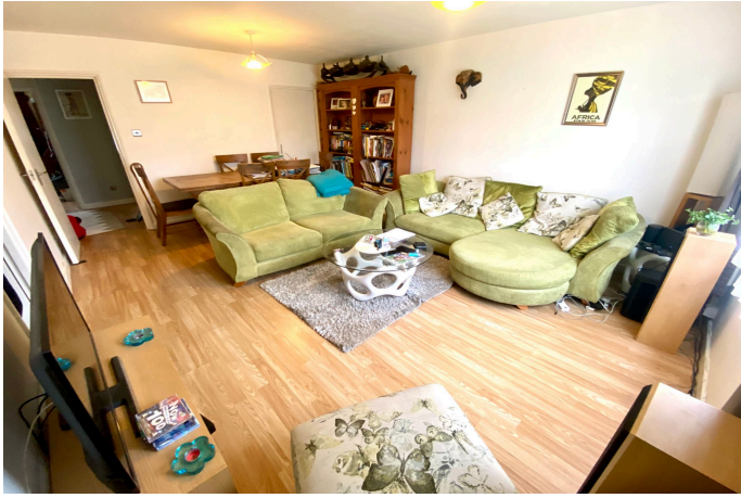
Flat, 70 Burrows Court, Lumbertubs, Northampton NN3 8JW £135,000 Leasehold