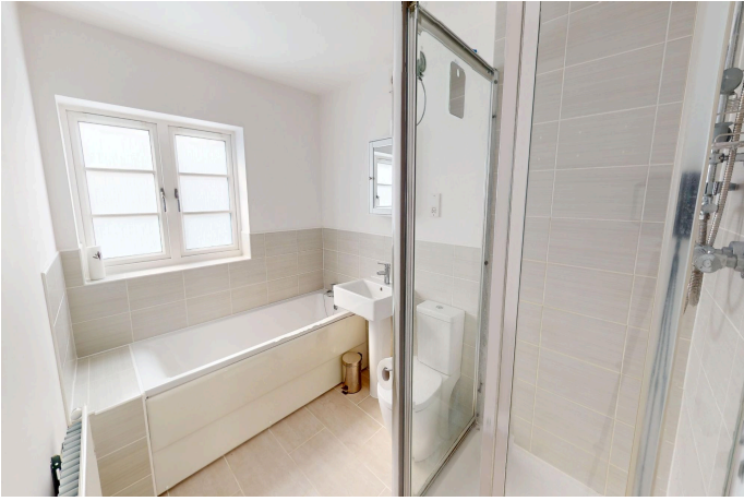
43 Leatherworks Way, Little Billing, Northampton NN3 9BP £375,000 Freehold