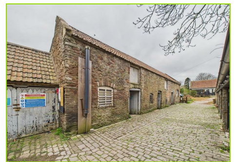
Barn 2a @, Bridge Farm Bell Hill, Stapleton, Bristol, BS16 1BQ