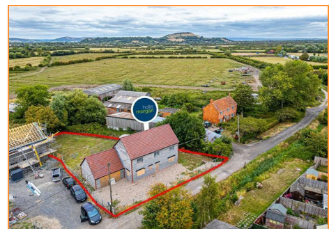
Plot 1, Brent Road Farm Brent Broad, Burnham-On-Sea, Somerset, TA8 2PX