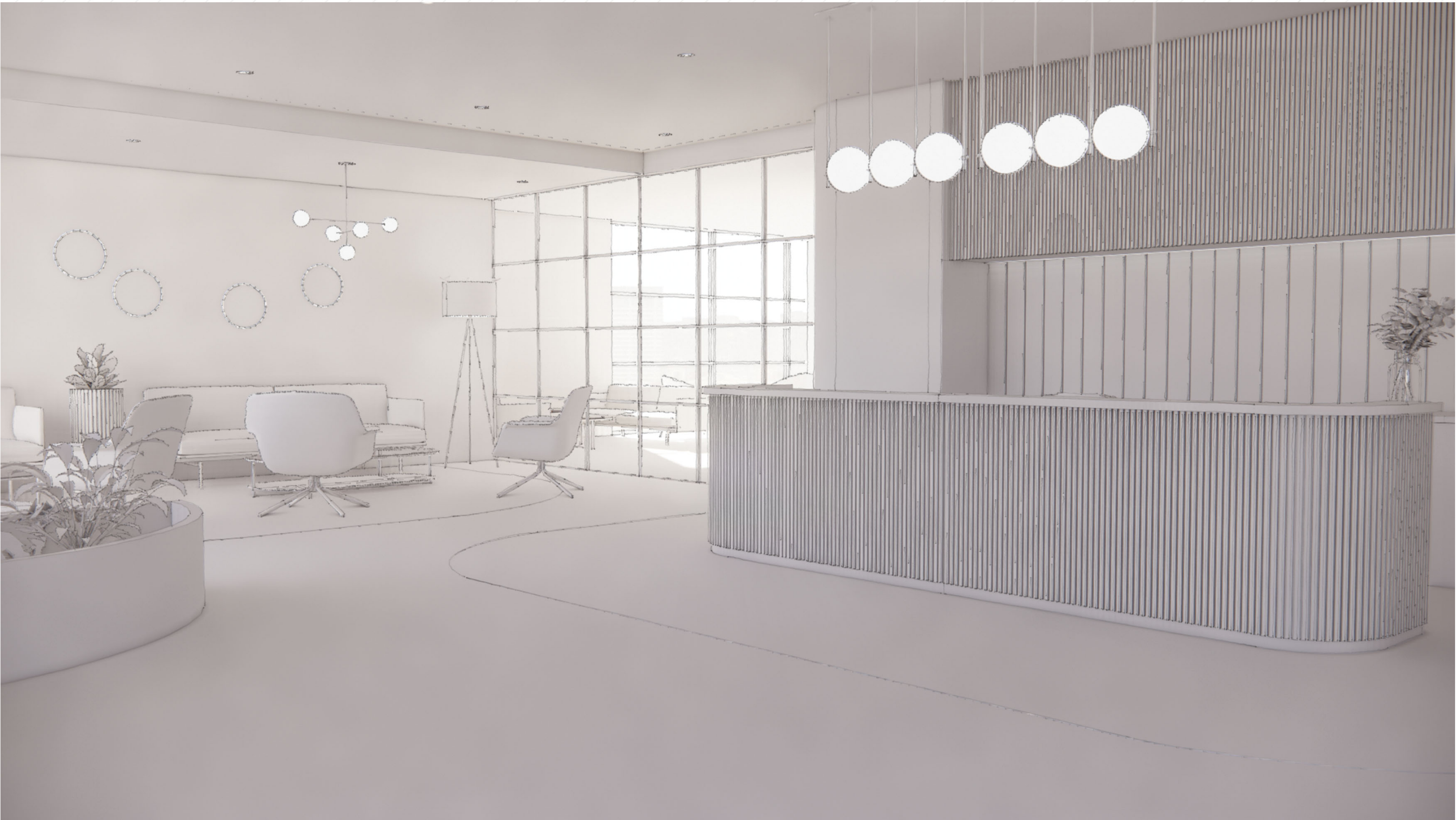
CGI - RECEPTION