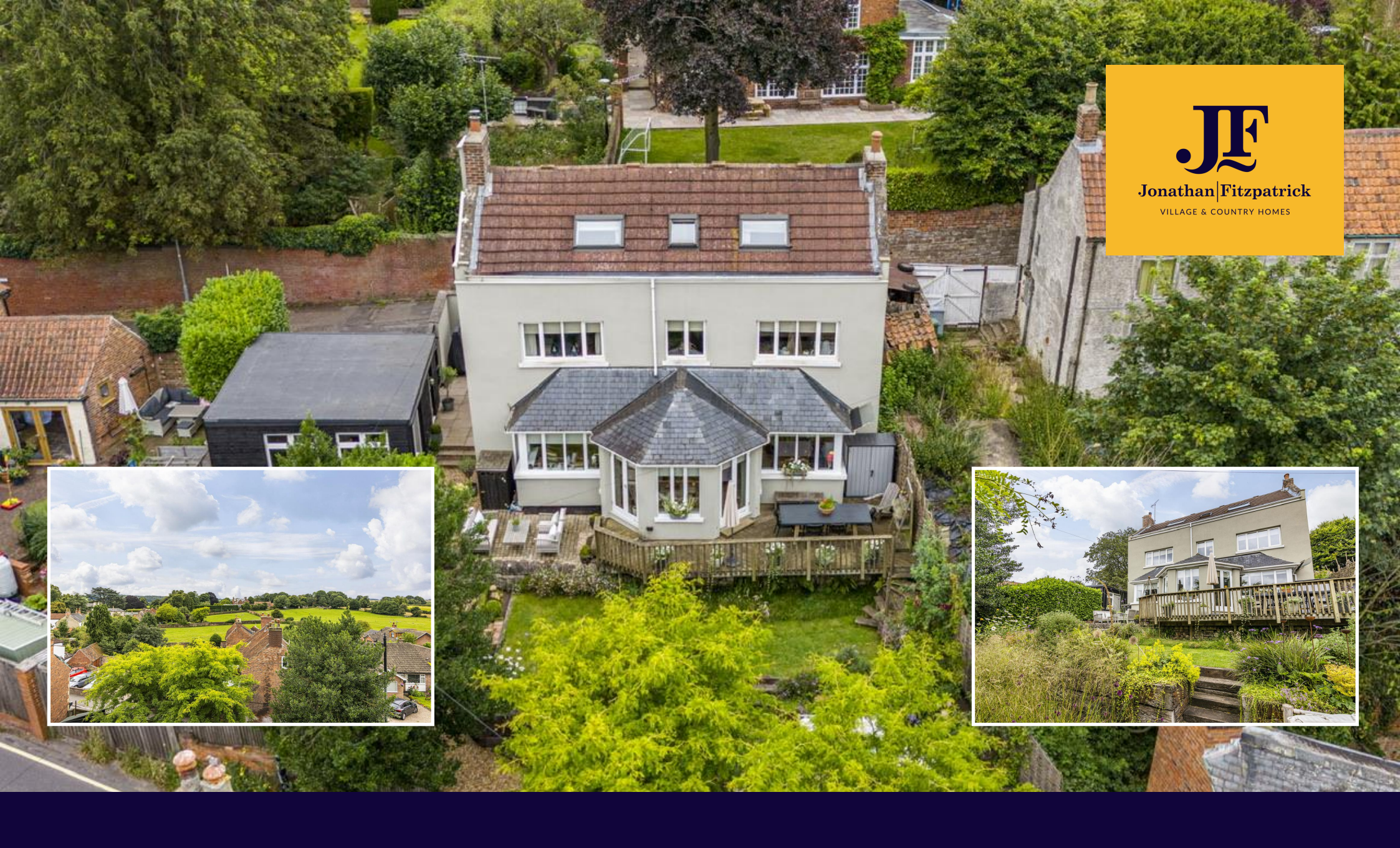
'Vine House' Chapel Lane Farnsfield NG22 8JW £775,000 Freehold