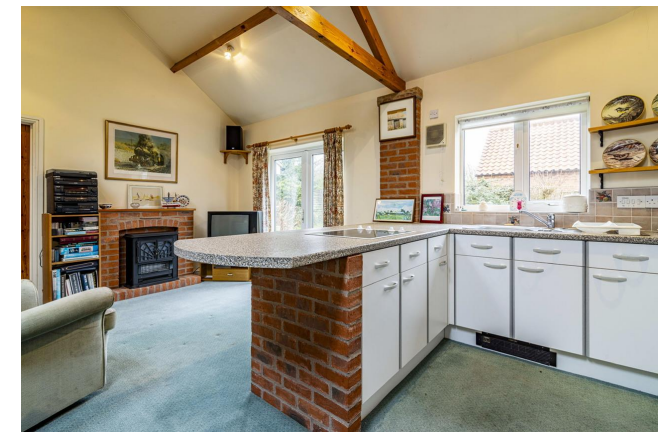
Above/below. The adjoining annexe comprises a large open plan living room with kitchen plus separate bedroom and wet room.