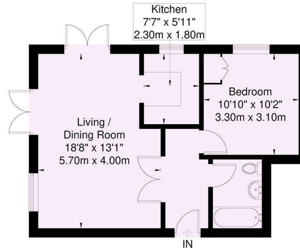
ILLUSTRATION FOR IDENTIFICATION PURPOSES ONLY ALL MEASUREMENT ARE MAXIMUM, AND INCLUDE WINDOW BAYS AND WARDROBES WHERE APPLICABLE THIS PLAN MUST NOT BE REPRODUCED BY ANY OTHER PERSON WITHOUT PERMISSION

14 Bishopthorpe Cloisters Approximate Gross Internal Area = 45.5 sq m / 489 sq ft