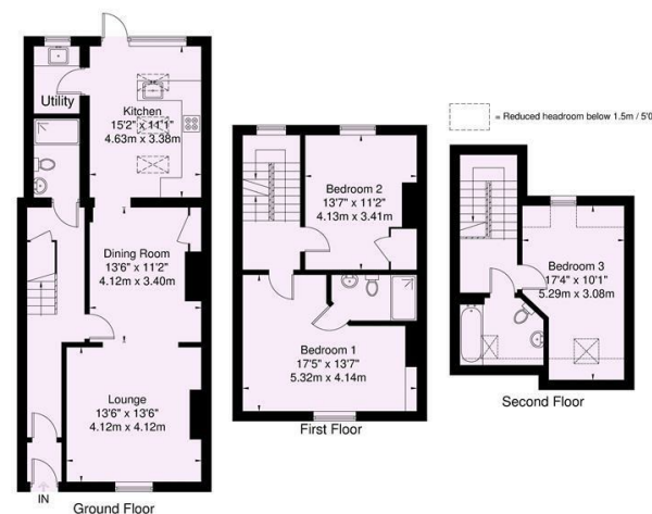
ILLUSTRATION FOR IDENTIFICATION PURPOSES ONLY ALL MEASUREMENT ARE MAXIMUM, AND INCLUDE WINDOW BAYS AND WARDROBES WHERE APPLICABLE THIS PLAN MUST NOT BE REPRODUCED BY ANY OTHER PERSON WITHOUT PERMISSION

48 Holgate Road Approximate Gross Internal Area = 141.7 sq m / 1525 sq ft