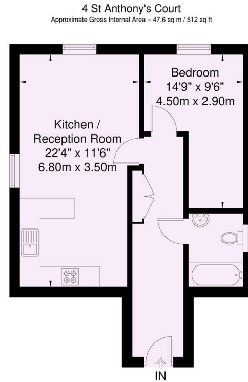
ILLUSTRATION FOR IDENTIFICATION PURPOSES ONLY ALL MEASUREMENT ARE MAXIMUM, AND INCLUDE WINDOW BAYS AND WARDROBES WHERE APPLICABLE THIS PLAN MUST NOT BE REPRODUCED BY ANY OTHER PERSON WITHOUT PERMISSION