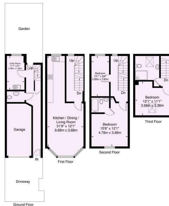
ILLUSTRATION FOR IDENTIFICATION PURPOSES ONLY ALL MEASUREMENT ARE MAXIMUM, AND INCLUDE WINDOW BAYS AND WARDROBES WHERE APPLICABLE THIS PLAN MUST NOT BE REPRODUCED BY ANY OTHER PERSON WITHOUT PERMISSION

Approximate Gross Internal Area = 119.0 sq m / 1281 sq ft