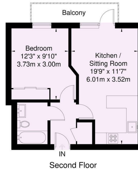
ILLUSTRATION FOR IDENTIFICATION PURPOSES ONLY ALL MEASUREMENT ARE MAXIMUM, AND INCLUDE WINDOW BAYS AND WARDROBES WHERE APPLICABLE THIS PLAN MUST NOT BE REPRODUCED BY ANY OTHER PERSON WITHOUT PERMISSION

49 Cordwainers Court Approximate Gross Internal Area = 39.9 sq m / 429 sq ft