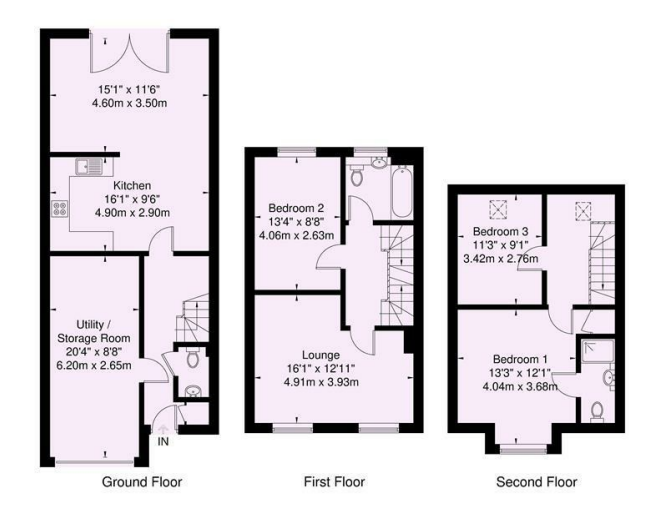
ILLUSTRATION FOR IDENTIFICATION PURPOSES ONLY ALL MEASUREMENT ARE MAXIMUM, AND INCLUDE WINDOW BAYS AND WARDROBES WHERE APPLICABLE THIS PLAN MUST NOT BE REPRODUCED BY ANY OTHER PERSON WITHOUT PERMISSION