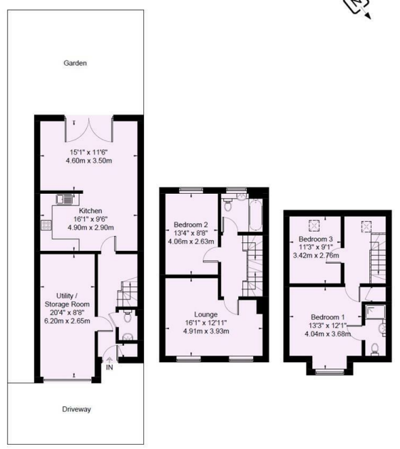
ILLUSTRATION FOR IDENTIFICATION PURPOSES ONLY ALL MEASUREMENT ARE MAXIMUM, AND INCLUDE WINDOW BAYS AND WARDROBES WHERE APPLICABLE THIS PLAN MUST NOT BE REPRODUCED BY ANY OTHER PERSON WITHOUT PERMISSION