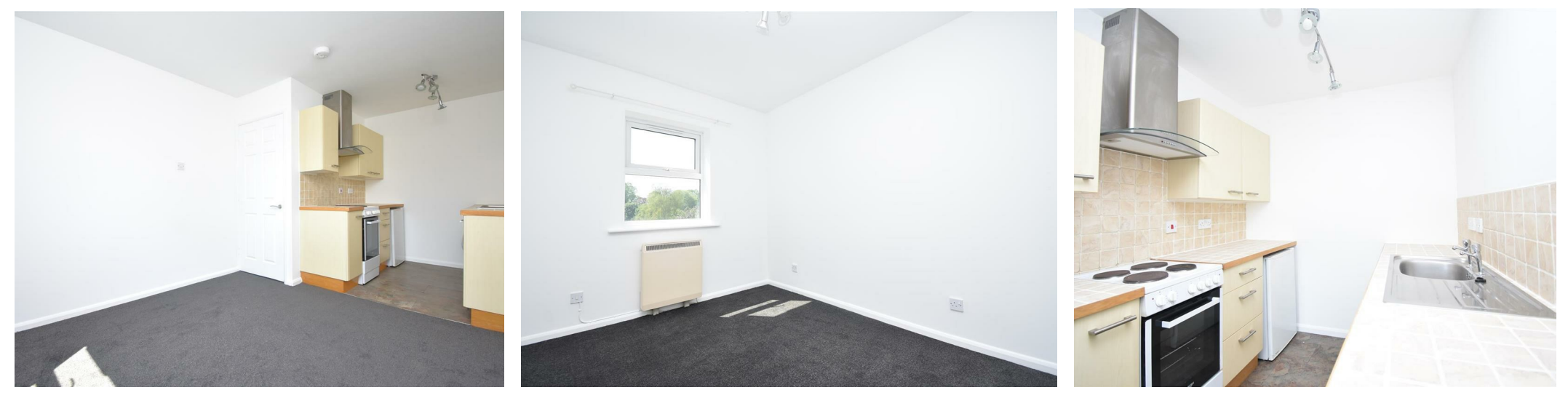
A well presented top floor apartment ideally located for the city centre, railway station and the very popular Bishopthorpe Road area.

The apartment is accessed via a staircase leading to the top floor and comprises a private entrance hall with doors leading to the open living room/kitchen area, double bedroom and a good sized bathroom.