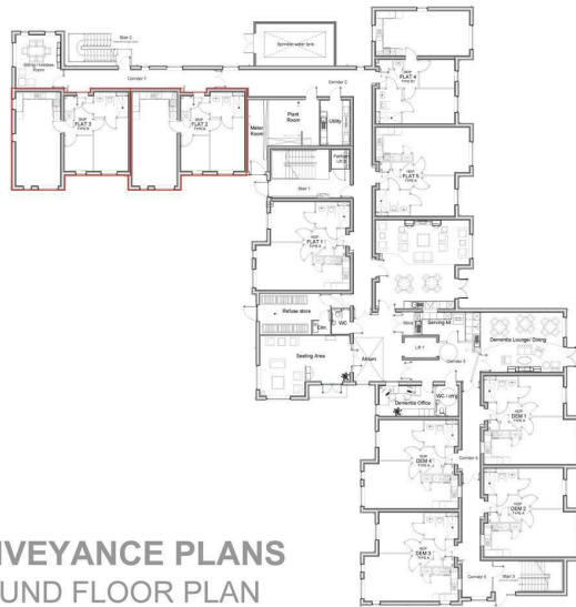
CONVEYANCE PLANS GROUND FLOOR PLAN