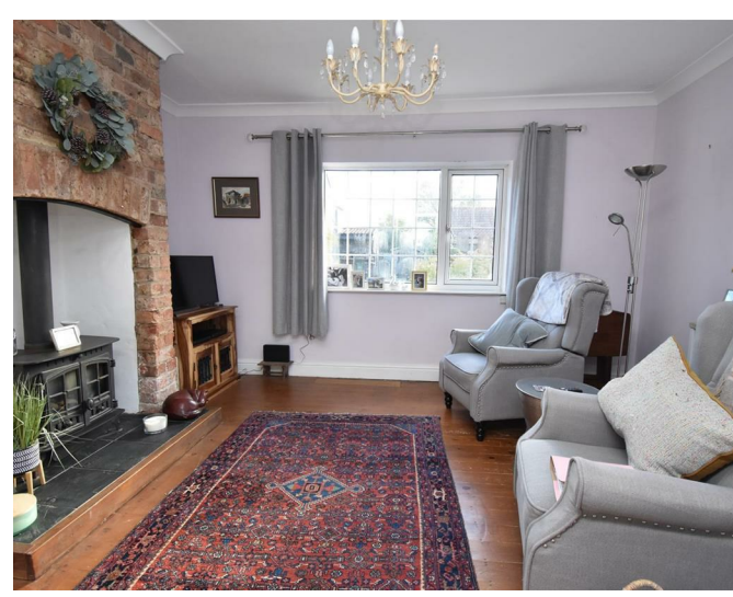
A charming three bedroom terraced house situated in the rural village of Wheldrake.

Located on main street close to local amenities the property has a charming country cottage feel. Accessed from the side the property offers a spacious kitchen/ diner with white goods, living room with gas fire. To the first floor are two double bedrooms, single bedroom/ office and family bathroom. Externally there is a garden to the rear with a storage shed, converted garage and off road parking for one vehicle.