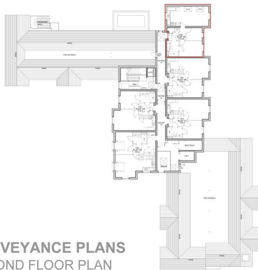
CONVEYANCE PLANS SECOND FLOOR PLAN