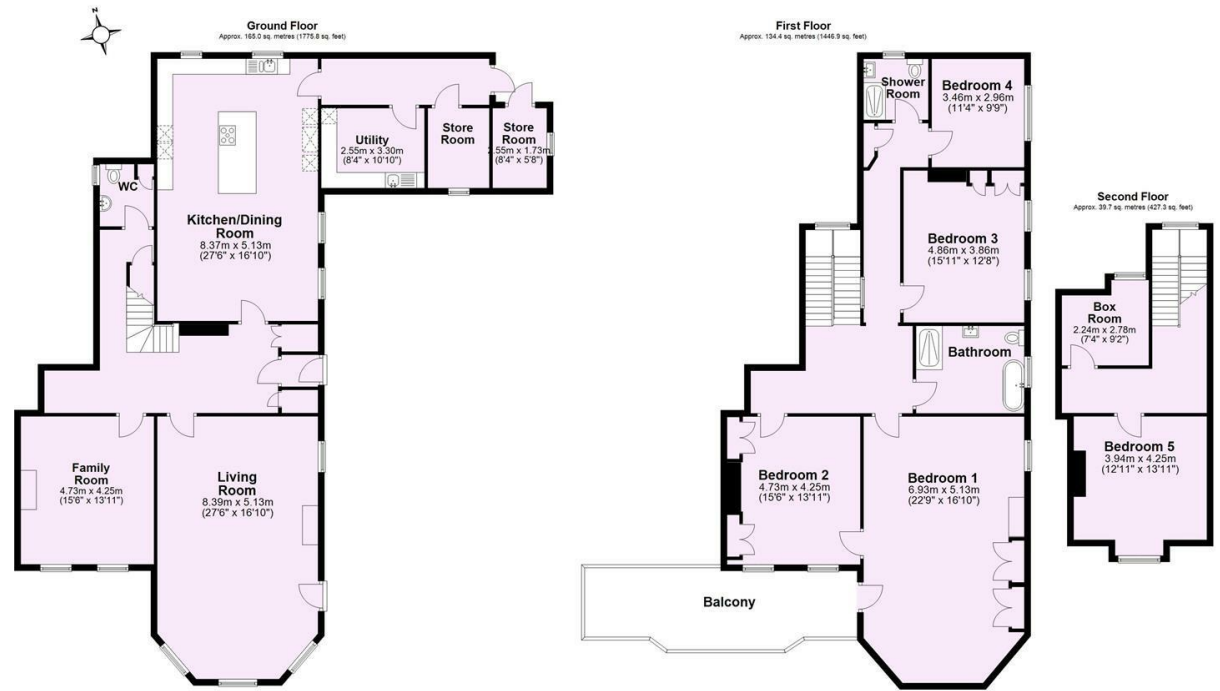
Total area: approx. 339.1 sq. metres (3649.9 sq. feet) For Illustrative Purposes Only, not to scale. Plan produced using PlanIt.