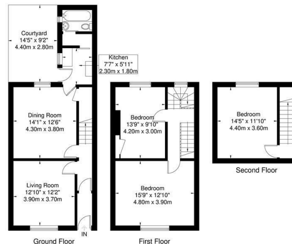
ILLUSTRATION FOR IDENTIFICATION PURPOSES ONLY ALL MEASUREMENT ARE MAXIMUM, AND INCLUDE WINDOW BAYS AND WARDROBES WHERE APPLICABLE THIS PLAN MUST NOT BE REPRODUCED BY ANY OTHER PERSON WITHOUT PERMISSION

15 George Street Approximate Gross Internal Area = 108.1 sq m / 1163 sq ft