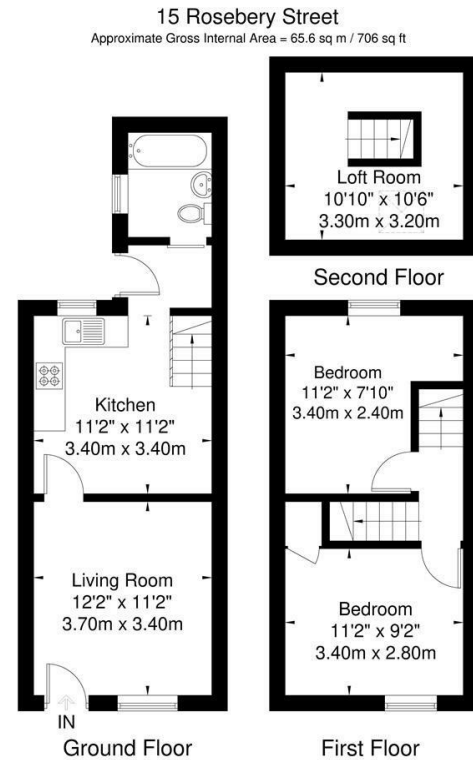
ILLUSTRATION FOR IDENTIFICATION PURPOSES ONLY ALL MEASUREMENT ARE MAXIMUM, AND INCLUDE WINDOW BAYS AND WARDROBES WHERE APPLICABLE THIS PLAN MUST NOT BE REPRODUCED BY ANY OTHER PERSON WITHOUT PERMISSION