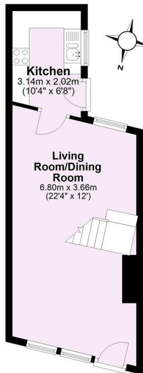
Ground Floor Approx. 30.9 sq. metres (332.8 sq. feet)