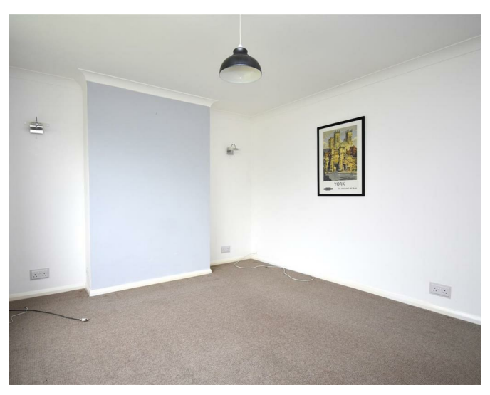
Charming 2-bedroom bungalow located in the picturesque village of Dunnington. This property boasts a spacious living area and modern fitted kitchen with appliances.

Outside is the front and rear gardens, providing ample outdoor space, along with a gravel driveway and garage for off-road parking.