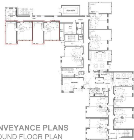
CONVEYANCE PLANS GROUND FLOOR PLAN