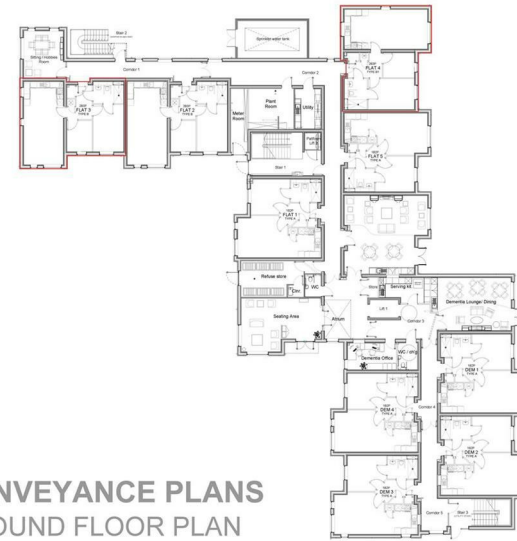
CONVEYANCE PLANS GROUND FLOOR PLAN