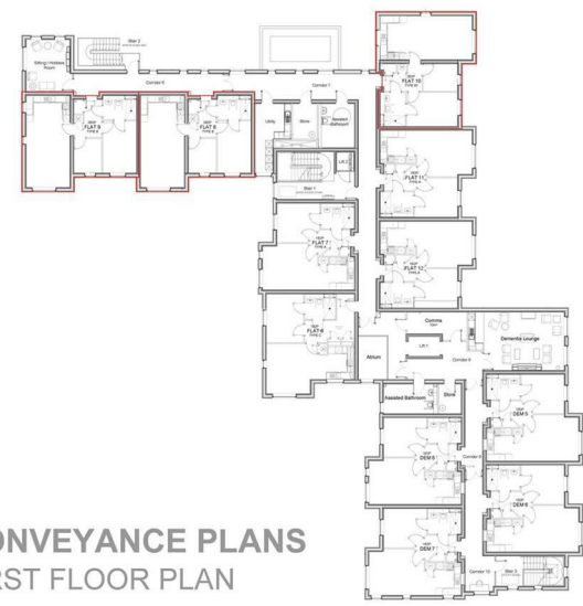
CONVEYANCE PLANS FIRST FLOOR PLAN