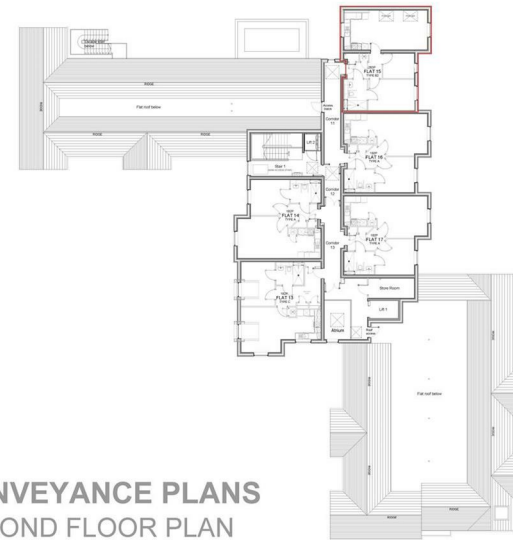
CONVEYANCE PLANS SECOND FLOOR PLAN