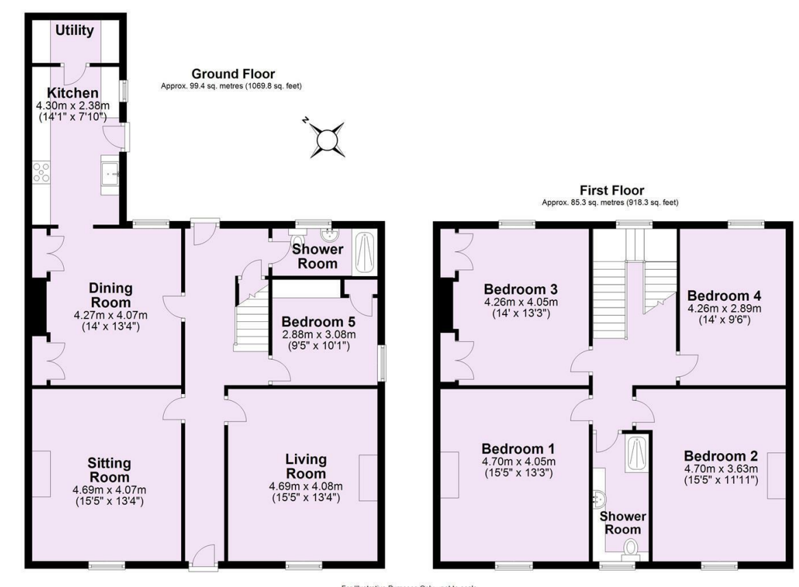
For Illustrative Purposes Only - not to scale Plan produced using PlanUp.