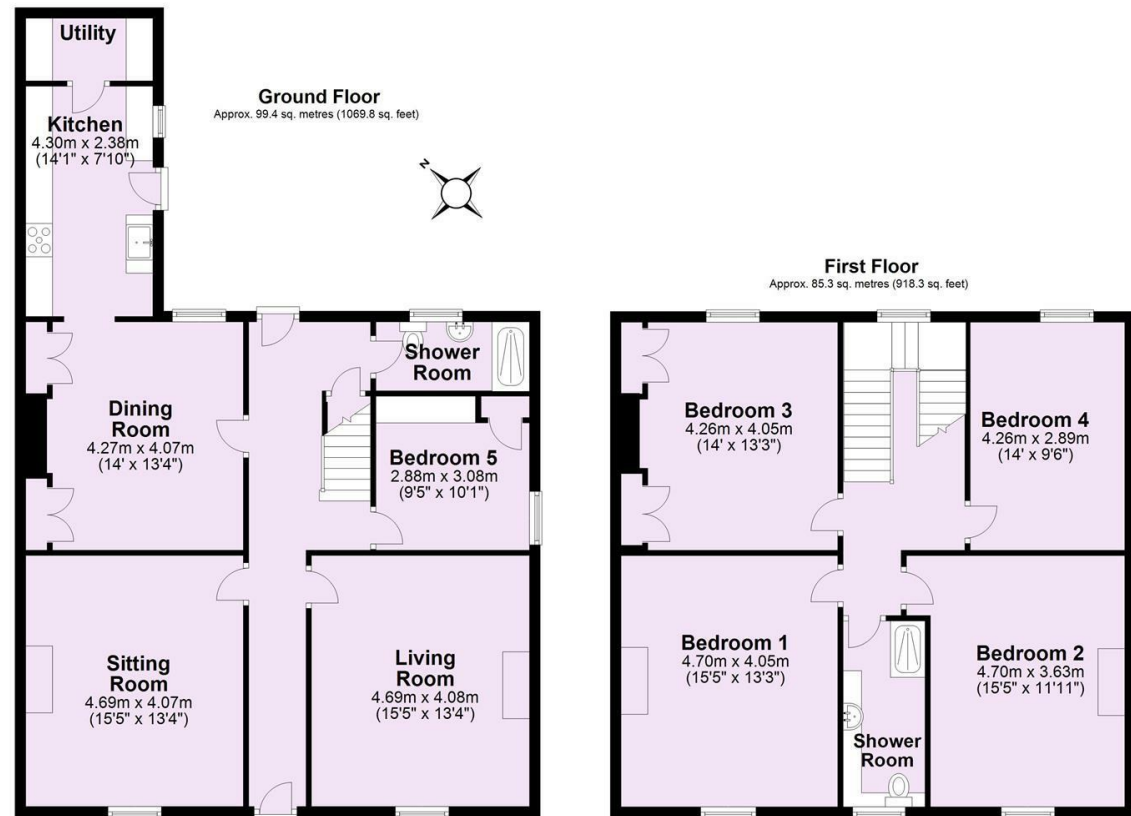
For Illustrative Purposes Only - not to scale Plan produced using PlanUp.