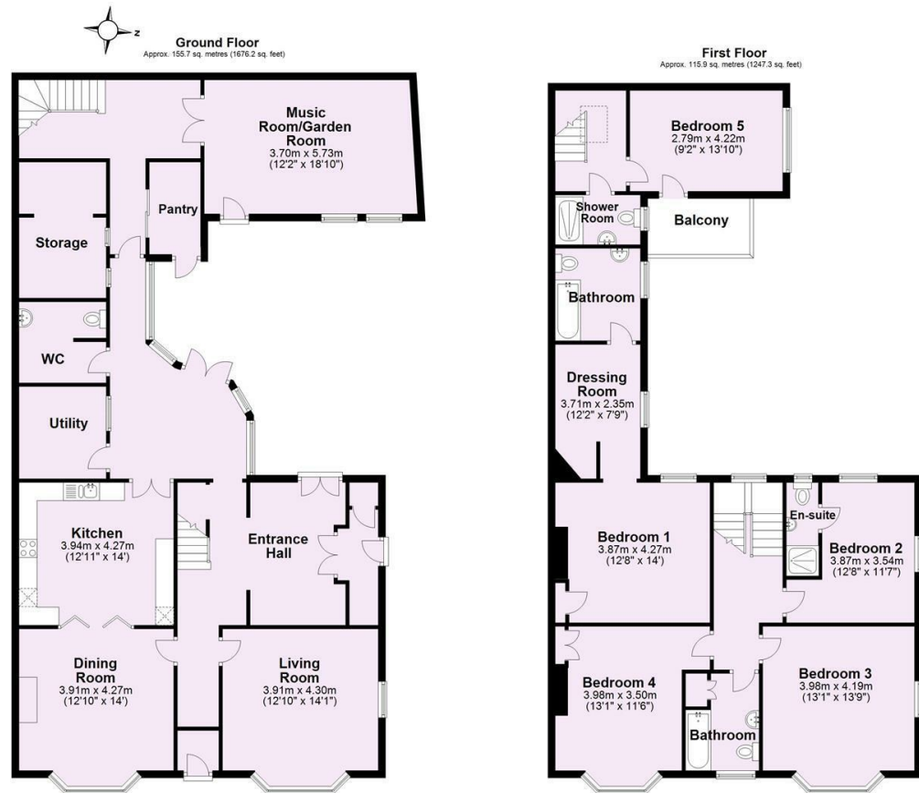
For Illustrative Purposes Only - not to scale Plan produced using Planitup.