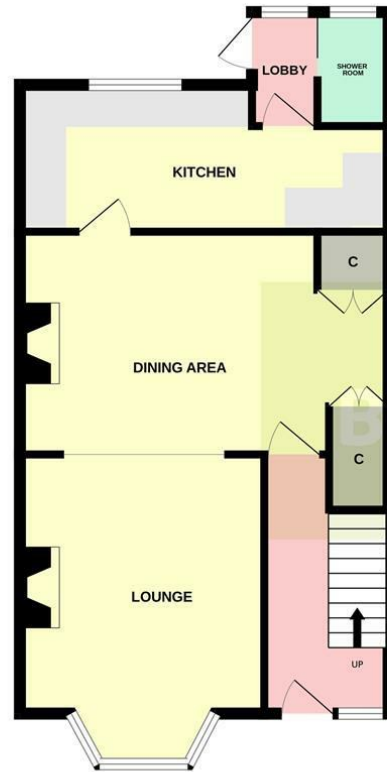
GROUND FLOOR 583 sq.ft. (54.1 sq.m.) approx.